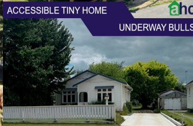
ACCESSIBLE TINY HOME